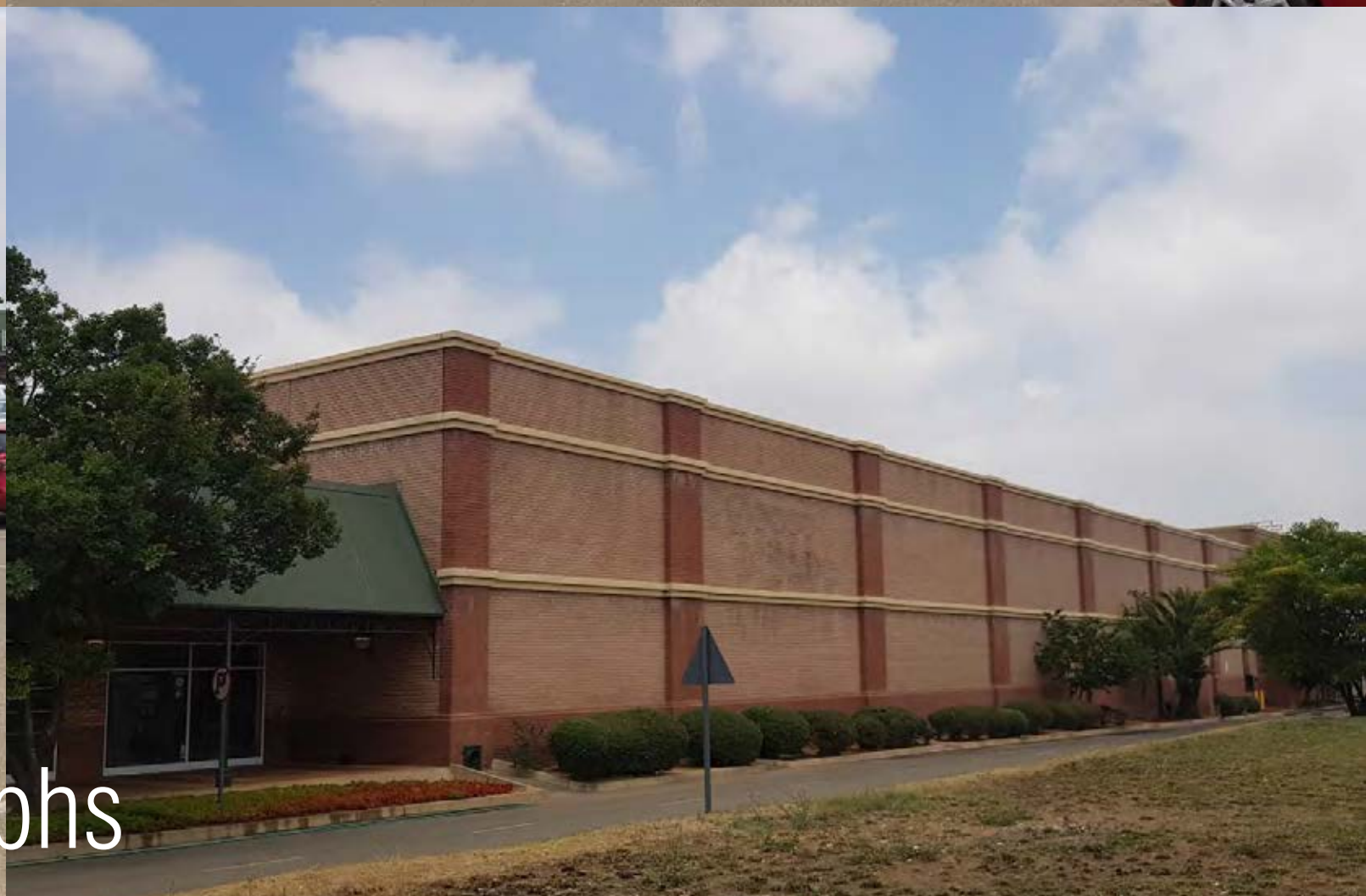
06 existing building photographs