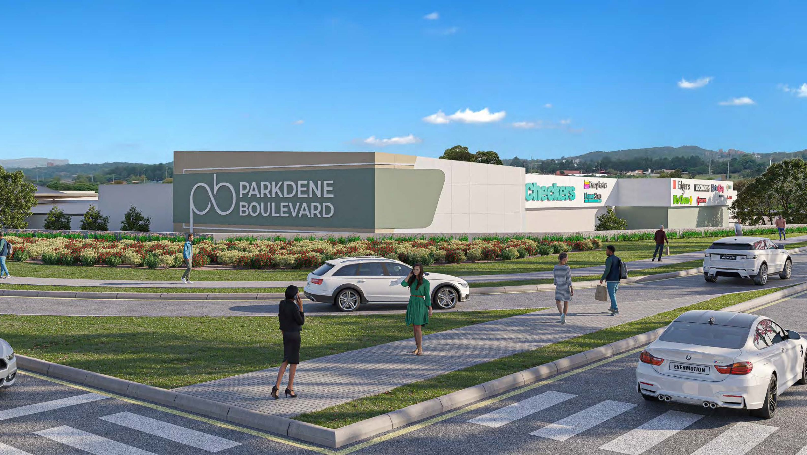
09 artist impression view from intersection